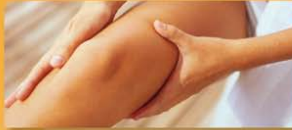
time-consuming creaming is no longer necessary

If it's about the right medical compression stocking, your skin now has a say in it. The new Venotrain® micro balance is a medical compression stocking with a rich and lavish balsamic emulsion for the first time ever. This has a decisive anti-haemostatic effect on your legs and will take care of them in an optimal way. When wearing the new Venotrain® micro balance regularly, your legs can anticipate every wish of your skin.